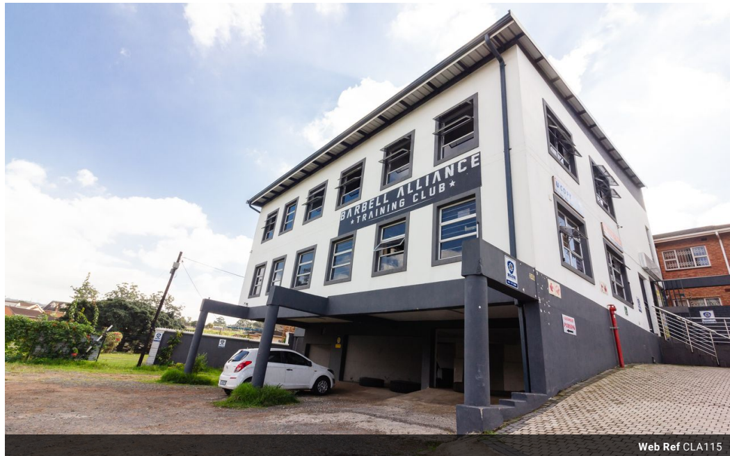
Web Ref CLA115