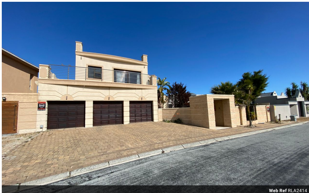
Web Ref RLA2414

Unit 4, Village Square 2 Village Place, Parklands