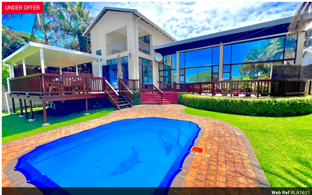
Web Ref RLA1621

Shop 5, Dolphin Place, Marine Drive, Uvongo, 4270