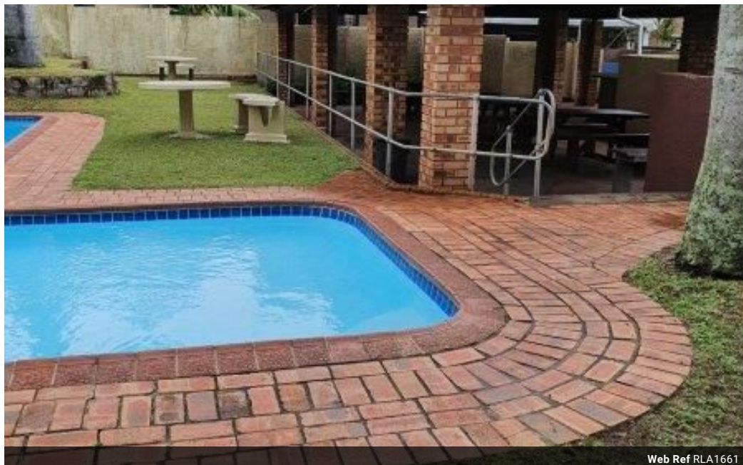
Web Ref RLA1661

41 Bullion Boulevard (Opposite Burger King) CBD Richards Bay 3900