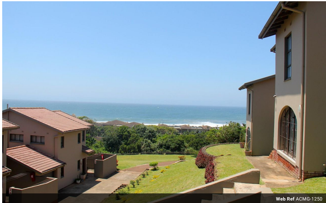
Web Ref ACMG-1250

Shop 5, Dolphin Place, Marine Drive, Uvongo, 4270