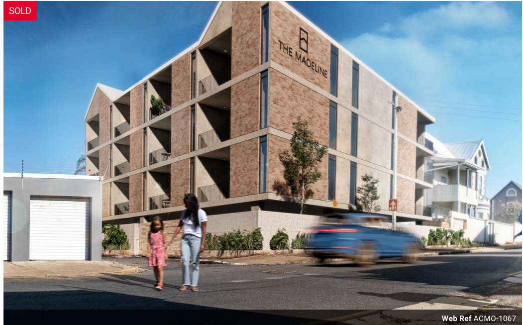
Web Ref ACMO-1067

376 Peter Mokaba Ridge, Overport, Durban