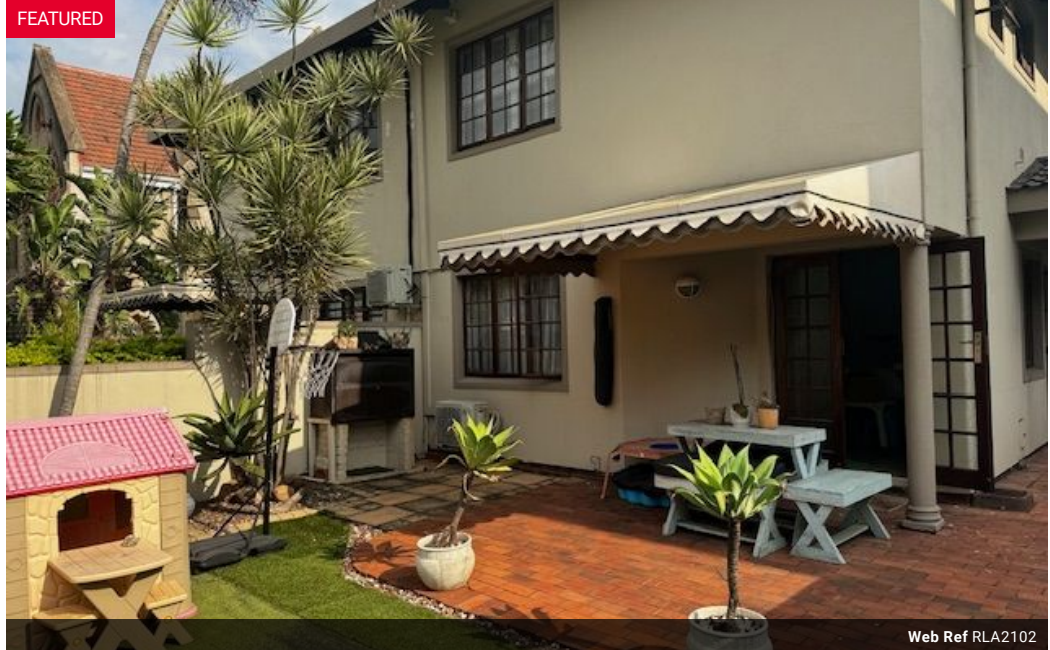
Web Ref RLA2102

376 Peter Mokaba Ridge, Overport, Durban