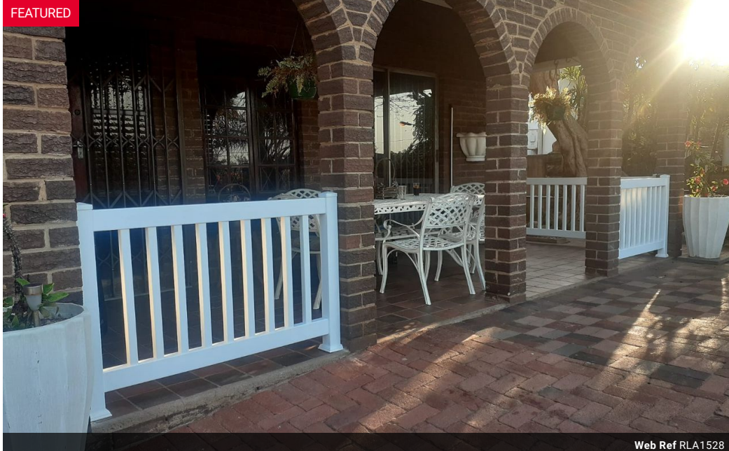
Web Ref RLA1528

2A Bluff Hillside Mall 201 Tara Road Bluff 4052