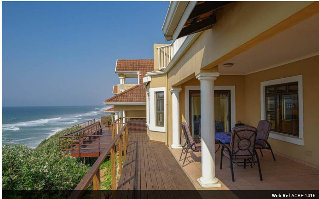
Web Ref ACBF-1416

2A Bluff Hillside Mall 201 Tara Road Bluff 4052