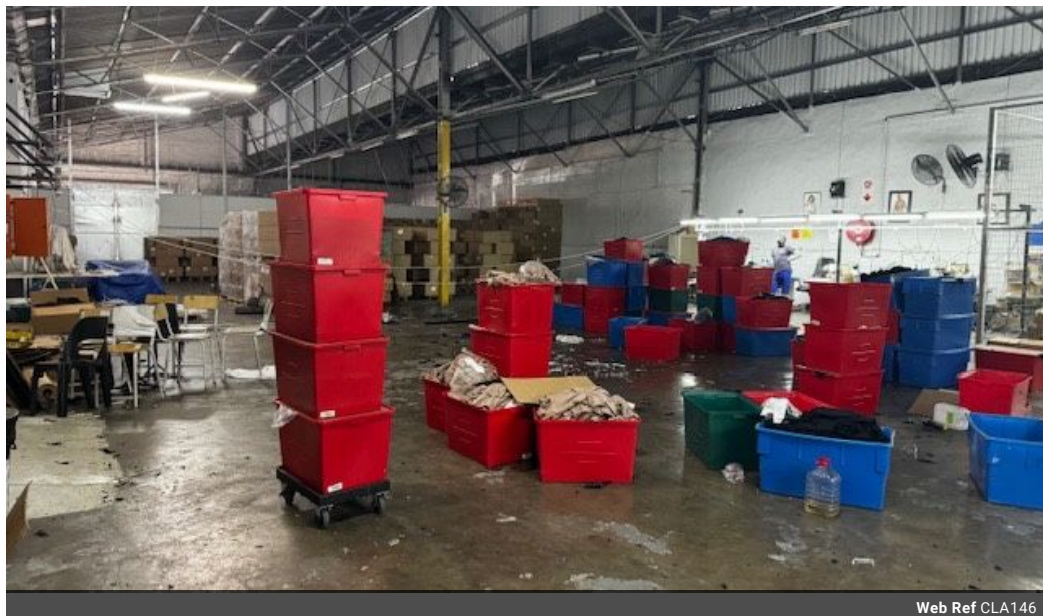
Web Ref CLA146

376 Peter Mokaba Ridge, Overport, Durban