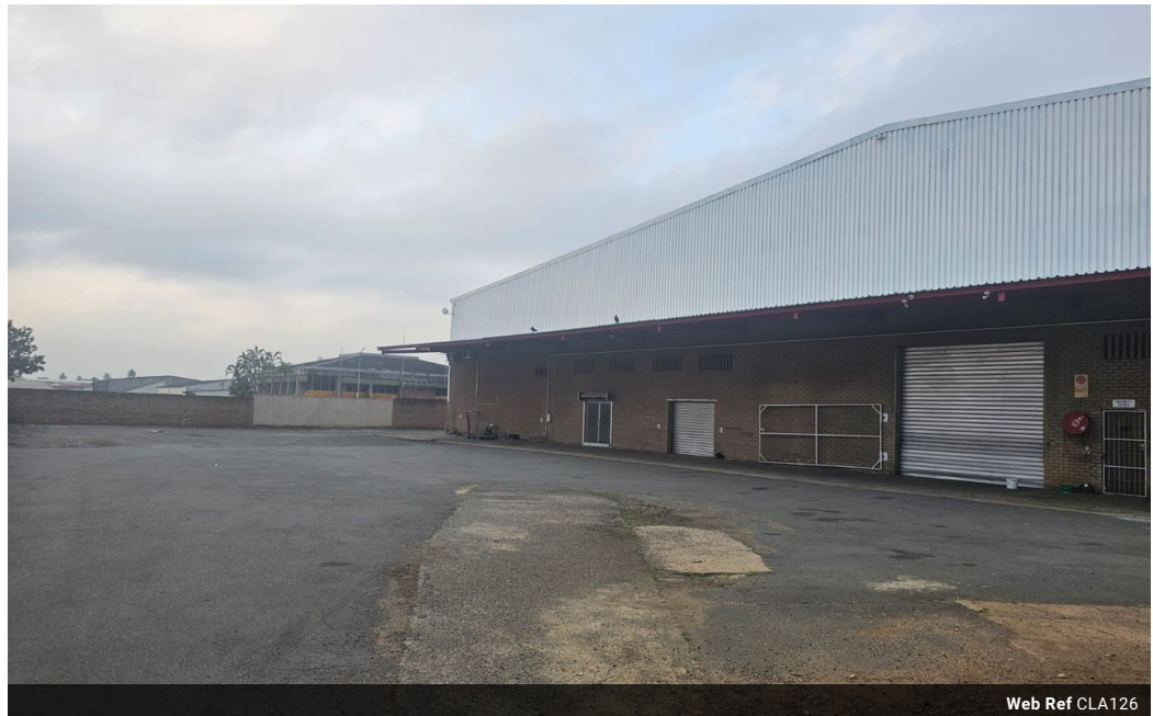
Web Ref CLA126

41 Bullion Boulevard (Opposite Burger King) CBD Richards Bay 3900