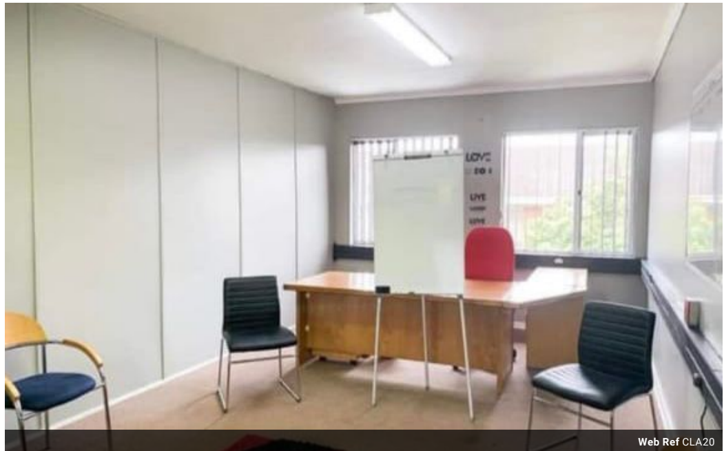
Web Ref CLA20

41 Bullion Boulevard (Opposite Burger King) CBD Richards Bay 3900