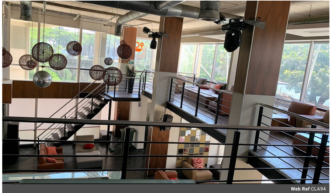
Web Ref CLA94

376 Peter Mokaba Ridge, Overport, Durban